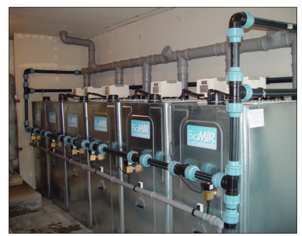
Small sewage plant with micro filtration