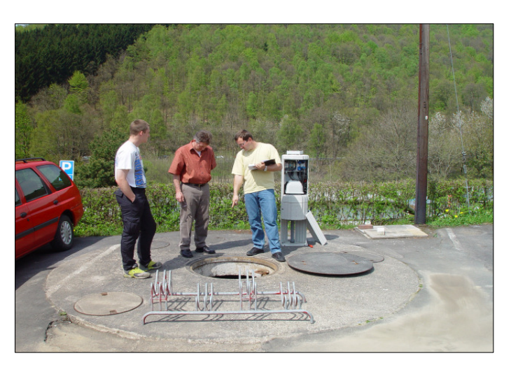
Septic tank with control unit